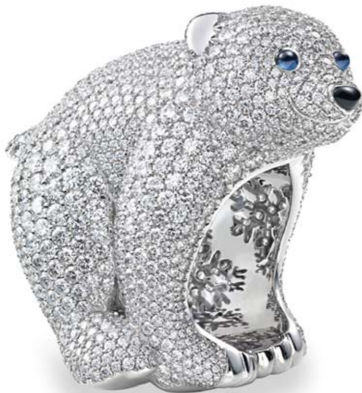
Polar Bear Ring Polar Bear ring composed of two sapphires (0,1ct), one onyx and diamonds (23,8ct) set in white gold.