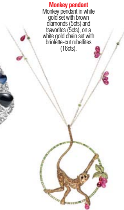
Monkey pendant Monkey pendant in white gold set with brown diamonds (5cts) and tsavorites (5cts), on a white gold chain set with briolette-cut rubellites (16cts).