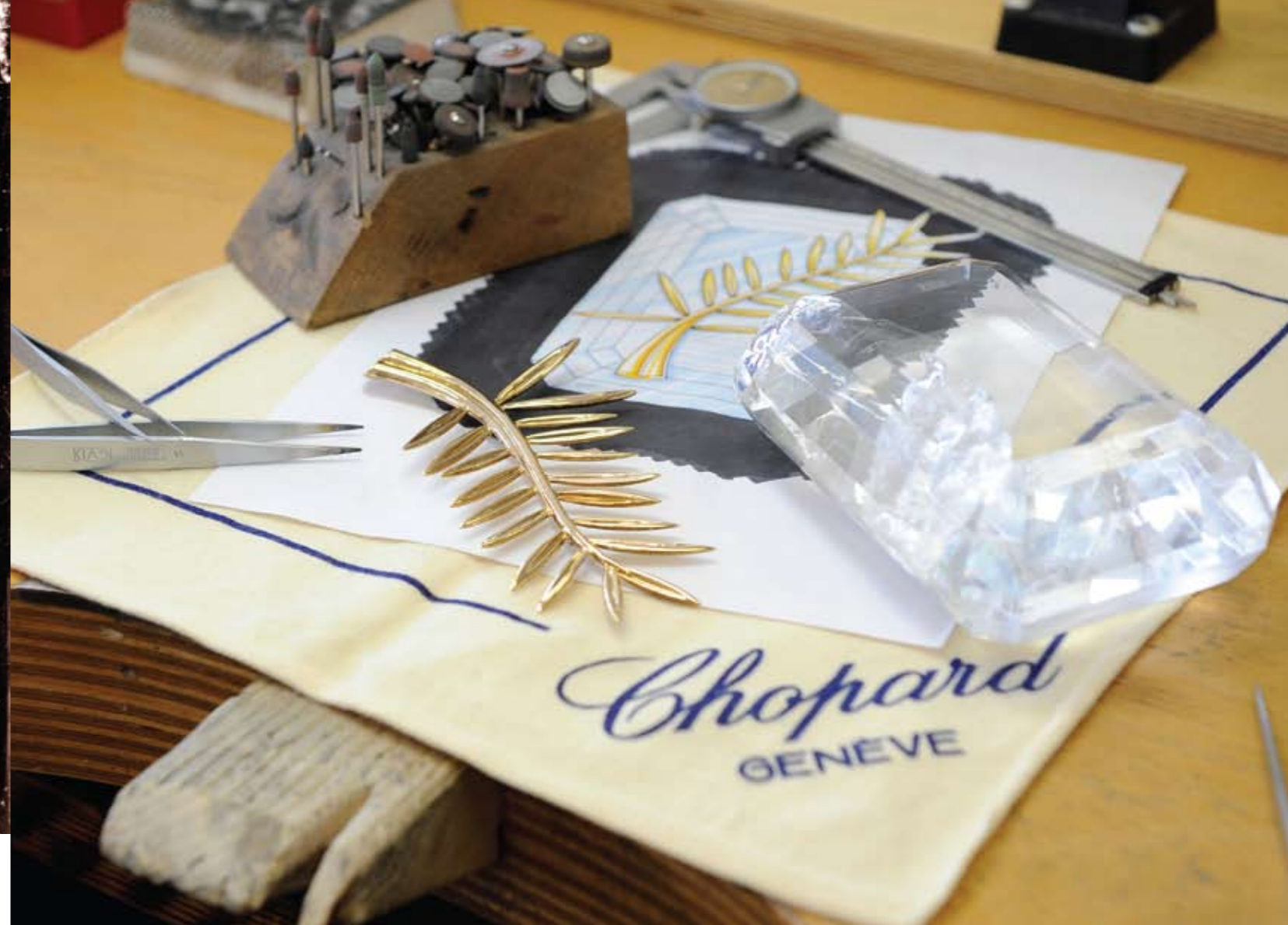
▲ Making of the Palme d'Or

famous designs include the Happy Sport, Imperiale, La Strada, Ice Cube, Two o Ten, Golden Diamonds, Happy Spirit, Casmir and many many more. The collections and designs were instant successes and have, over time become timeless classics. They drew inspiration from various sources including the beautiful mountainous regions of Kashmir (India) and pebbles skipping across water.