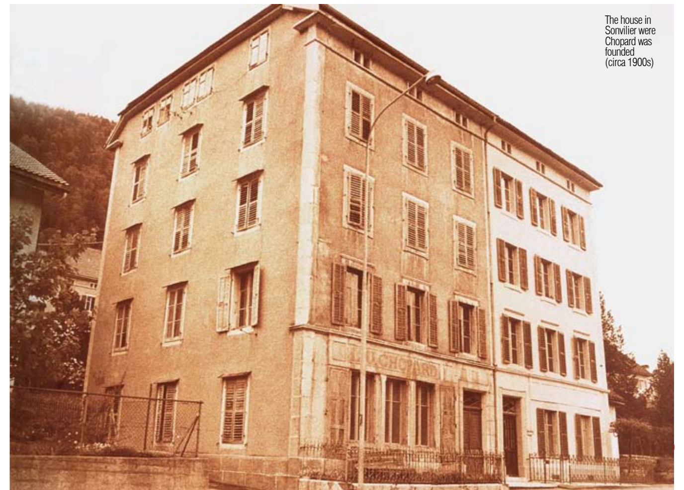
The house in Sonvilier where Chopard was founded (circa 1860s)

Various subsidiaries have been set up around the world so as to strengthen Chopard's international presence. In 1975, the French subsidiary was set up in Paris, followed in 1976 by the