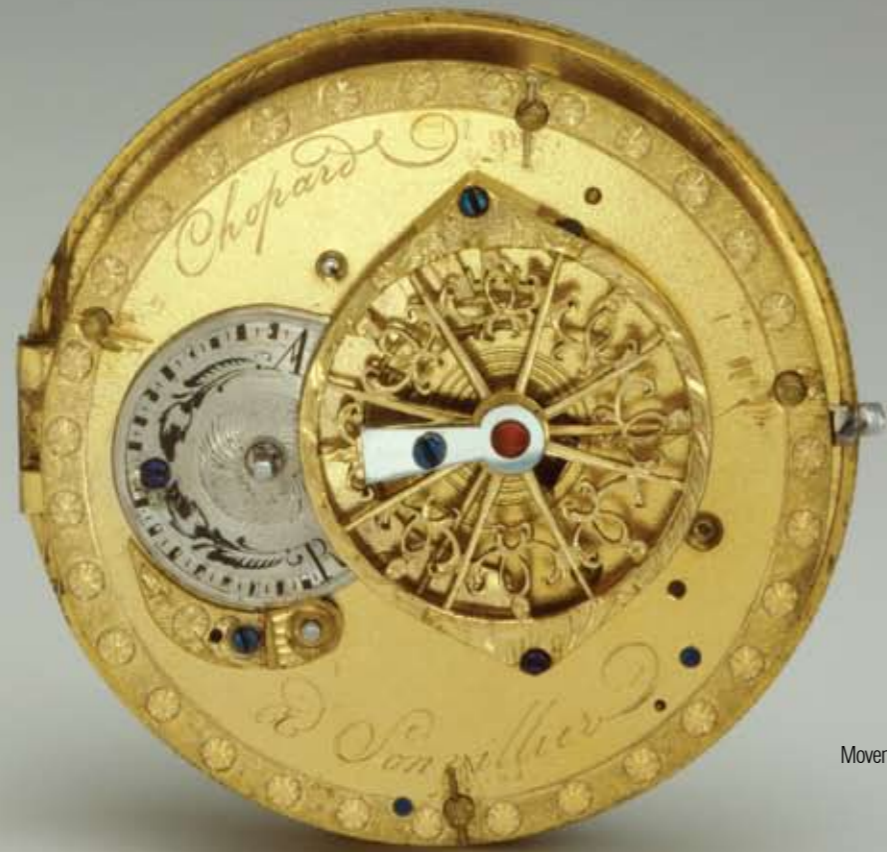
Movement of one of the first Chopard pocket watches in the 1860s