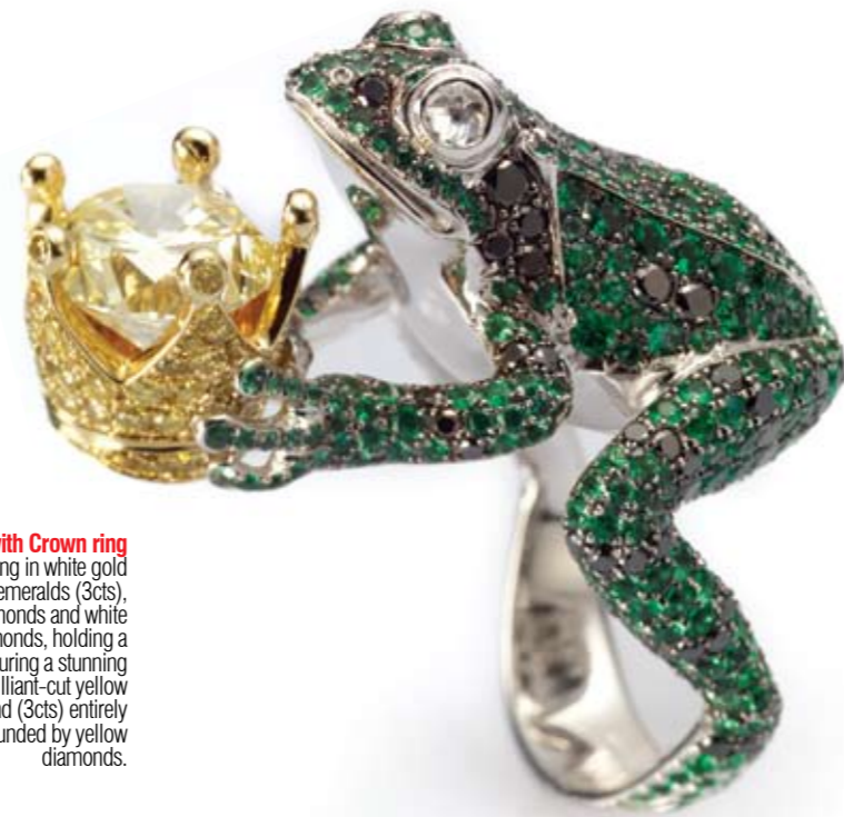
Frog with Crown ring Frog ring in white gold set with emeralds (3cts), black diamonds and white diamonds, holding a crown featuring a stunning brilliant-cut yellow diamond (3cts) entirely surrounded by yellow diamonds.

The Chopard range is available exclusively at Khimji's Watches, Shatti Al Qurum.