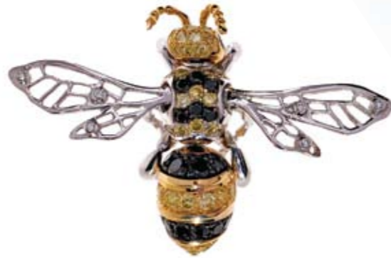
Bee Brooch Bee Brooch in white and yellow gold set with black, yellow and white diamonds.